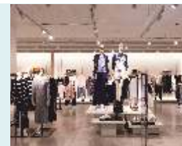
Double Height ceiling shops