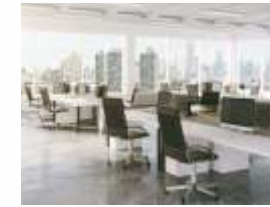
IT/ITES Office Space